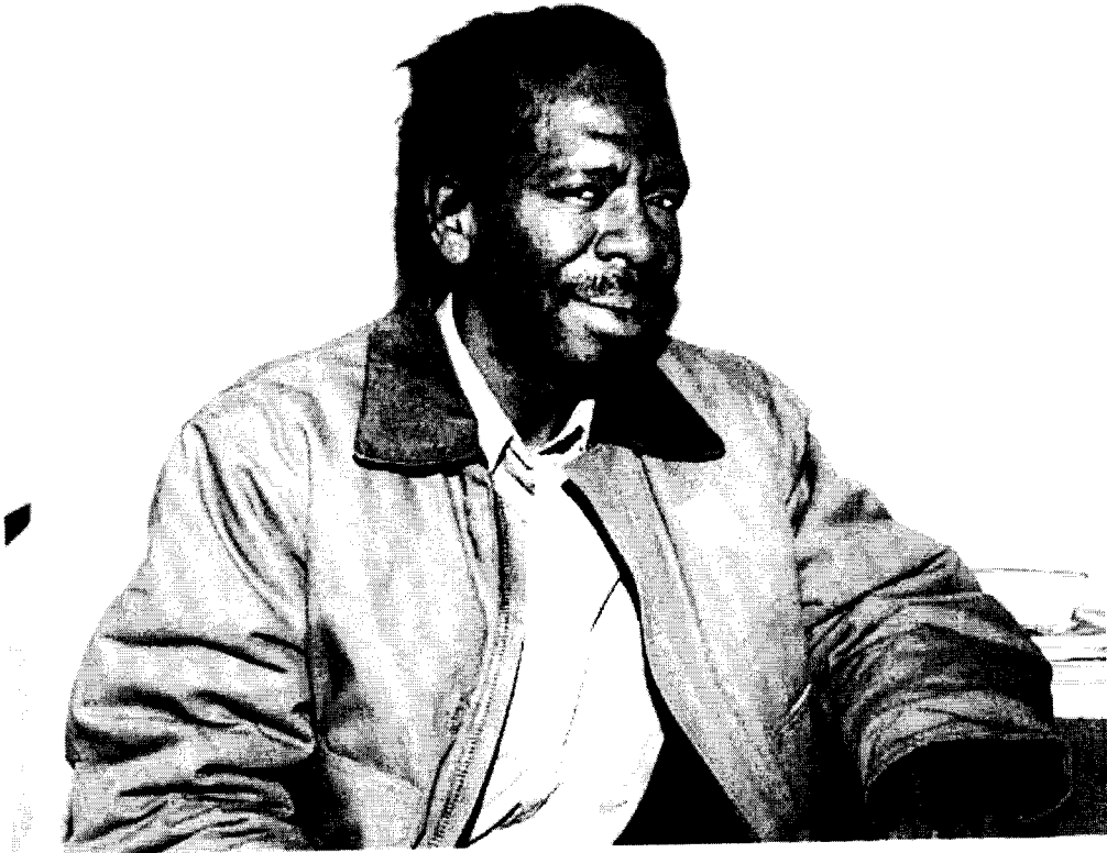
Mariba in day shelter.