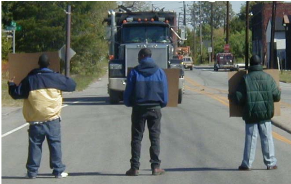
The photographs in this brochure were taken during a community organizing event to protest close 9th and 10th Street in 2001

EPDC believes these can be attained through strategic community planning, urban design, on-going community organizing and accessible adult education.