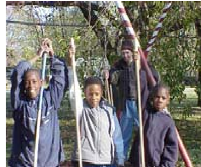
Children enjoy playing in a newly renovated park

"We'll bring it back to its full glory!"