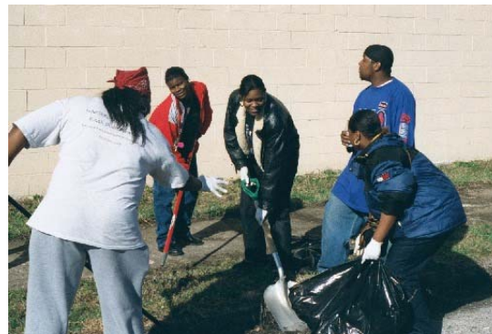
Youth Build students cleaning up around the EPDC incubator on the corner of State and 29th Street.

"We'll bring it back to its full glory!"