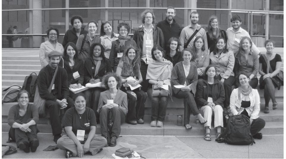
Members of PAGE wrap up the 2008 conference with a meeting on the steps of the Japanese American History Museum in Los Angeles. Over seventy graduate students attended the conference this year. Celebrating its fifth consecutive convening at IA’s annual conference, PAGE was able to invite thirteen graduate students to LA as funded PAGE fellows.